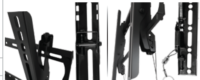
Heavy duty leveling mechanism